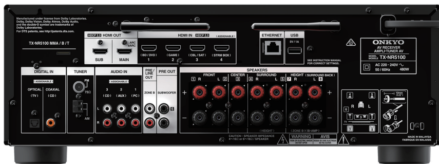
Text on receiver may vary by region.