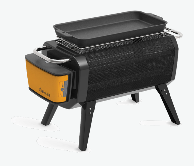
for use with FirePit and FirePit OvenTop (sold separately)