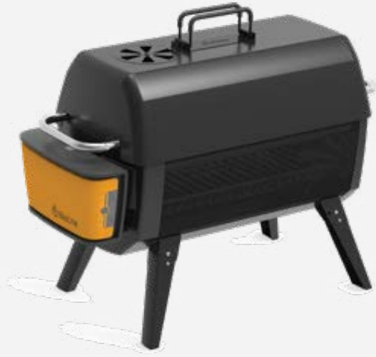
for use with FirePit+ (sold separately)